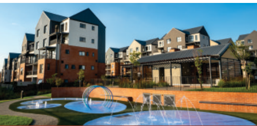
The Precinct Luxury Apartments Located on Mushroom Rd, Waterfall

Other exciting RENTAL projects currently on show by HOUSS Rentals: