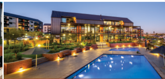
Indawo Lifestyle Apartments Located on Mushroom Rd, Waterfall