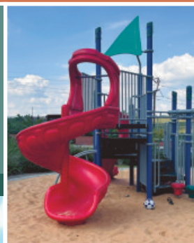
Kids' Play Parks