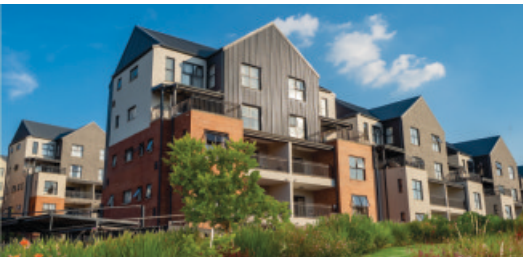
Meander Lifestyle Apartments Located next to Steyn City, Riversands, Joburg