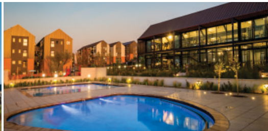
5ive on Thirteenth Lifestyle Apartments Located next to MTN head office, Northcliff