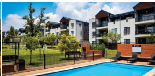
Carlswald Luxury Apartments Located on Tambotie Rd, Midrand