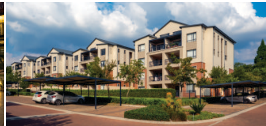
Crowthorne Luxury Apartments Located on Whisken Ave, Midrand