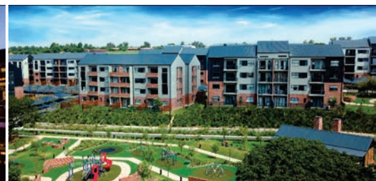
The Parks, Riversands

For more information on any of these developments, contact us on 0800 736825