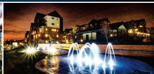
The Precinct Luxury Apartments