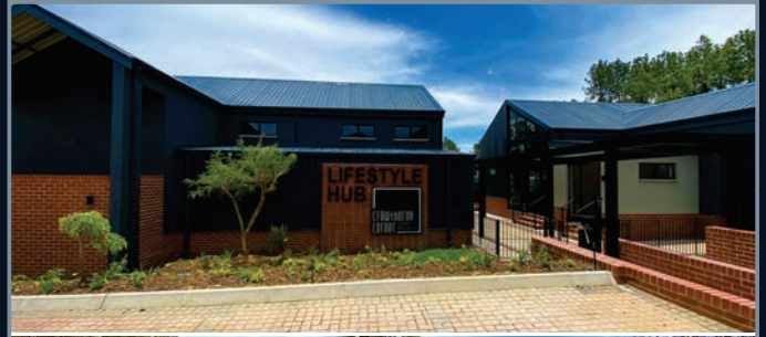
Crowthorne Corner Clubhouse with Gym