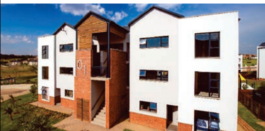
Carlswald Luxury Apartments