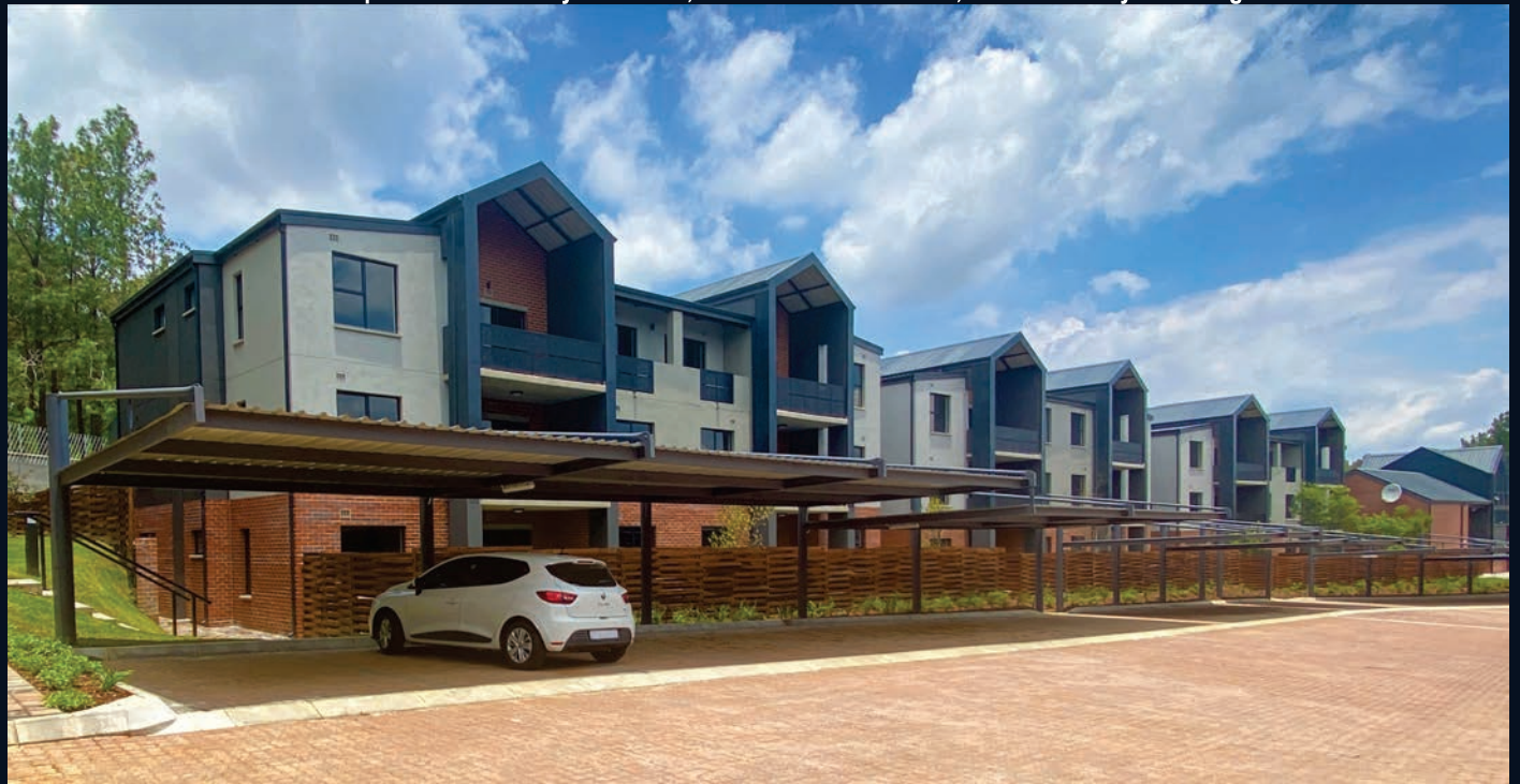
Crowthorne Corner's apartments are easy to furnish, has a modern aesthetic, and feature stylish fittings and finishes.