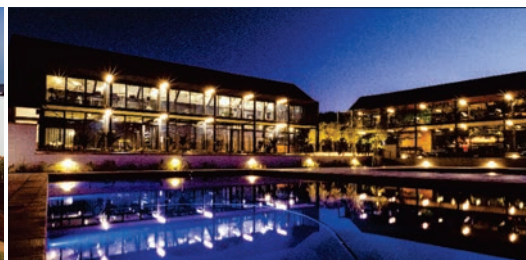
5ive on Thirteenth Luxury Apartments